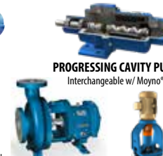
2196 ANSI PUMPS* Interchangeable w/ Goulds® 3196