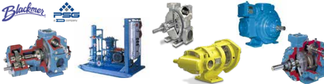
BLACKMER PUMPS Rotary sliding vane (including magnetic drive), iron and stainless steel, positive displacement pumps. SPECIALTY PRODUCTS: Gas compressors, oil free, single and two stage, and liquefied gas pumps.