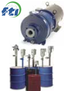
FINISH THOMPSON PUMPS ANSI teflon lined, small plastic/sanitary centrifugal mag drives and drum pumps. Stainless and plastic sealed pumps and accessories.