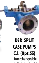
DSR SPLIT CASE PUMPS C.I. (Opt. SS) Interchangeable w/ Worthington® LN