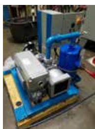
All-in-one mobile vacuum pump package with control panel for power plant.