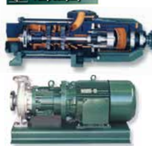
DICKOW MAGNETIC DRIVEN PUMPS Magnetic Drive metallic pumps including high temperature, ANSI, DIN, API-685 centrifugal, side channel and multi-stage used for hot oils, liquefied gases and volatile and corrosive liquids.