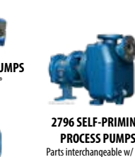
2796 SELF-PRIMING PROCESS PUMPS Parts interchangeable w/ Summit 2196 ANSI (Ex. Casing)