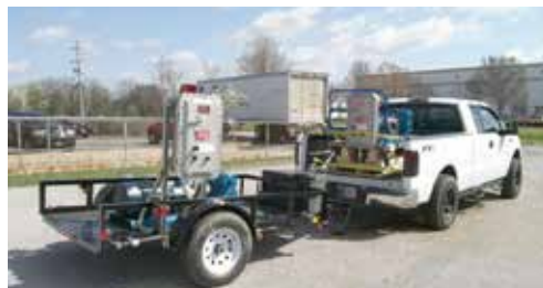
Custom built mobile units for a major oil company to test gasoline in multiple locations.