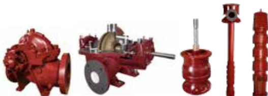
340 series Double suction split case pumps

Vertical turbine and horizontal split case pumps.