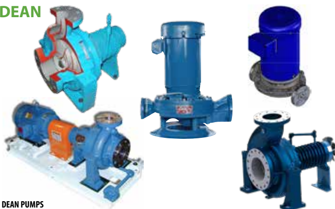
DEAN PUMPS Inline, ANSI, high temperature, vertical sump, self-priming, API610 (5th edition) Magnetic drive ANSI and hot water and hot oil pumps.