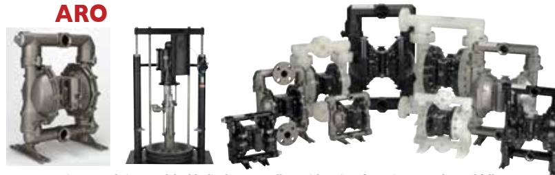
ARO PUMPS Air operated piston and double diaphragm, sealless, with options for sanitary, powder, and fully automatic with electronic interface. Both bolted and band-clamp options. ARO offers a full range of accessories compatible with other diaphragm pumps and systems including: Filter-Regulator-Lubricators; Shock Blocker™ pulsation dampeners; and system controls options.