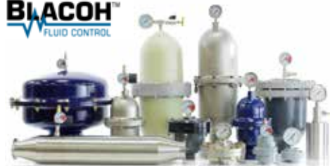
BLACOH DAMPENERS Remove hydraulic shock and vibration, enhancing all-around performance and reliability of fluid flow applications.