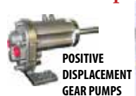
POSITIVE DISPLACEMENT GEAR PUMPS