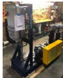
Explosion proof compressor package to transfer liquified gases.