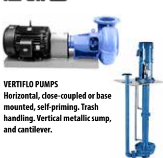
VERTIFLO PUMPS Horizontal, close-coupled or base mounted, self-priming. Trash handling. Vertical metallic sump, and cantilever.