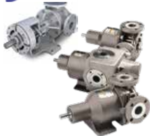
BLACKMER GEAR PUMPS 10-15% savings on high quality replace- ments for Viking pumps and parts. Pumps available in sealed and sealless (magnetic drive) cast iron, carbon steel, and stainless steel construction.