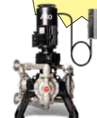
Electric diaphragm pumps available in metallic and non-metallic materials.