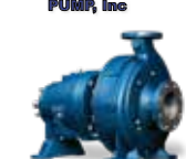
2175 PROCESS PUMPS Interchangeable w/ Goulds® 3175