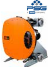
ABAQUE PERISTALTIC HOSE PUMPS