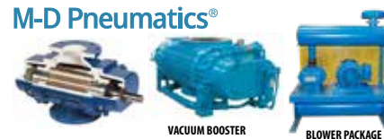
VACUUM BOOSTER BLOWER PACKAGE

AIR & GAS BLOWERS & BLOWER SYSTEM SOLUTIONS Rotary positive displacement blowers and vacuum boosters. interchange units for Roots, Sutorbilt and Duroflow.