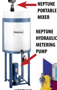
NEPTUNE PORTABLE MIXER