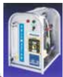
POLYMASTER POLYMER FEEDER