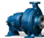
2175 PROCESS PUMPS Interchangeable w/ Goulds® 3175