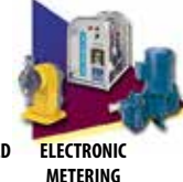
NEPTUNE CHEMICAL FEED PACKAGE