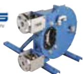
ABAQUE PERISTALTIC HOSE PUMP