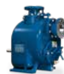
SN PUMPS C.I. (Opt. SS) Interchangeable w/ Gorman Rupp® T and Super T