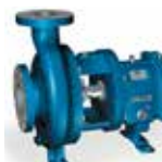
2196 ANSI PUMPS* Interchangeable w/ Goulds® 3196