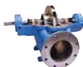
DSR SPLIT CASE PUMPS C.I. (Opt. SS) Interchangeable w/ Worthington® LN