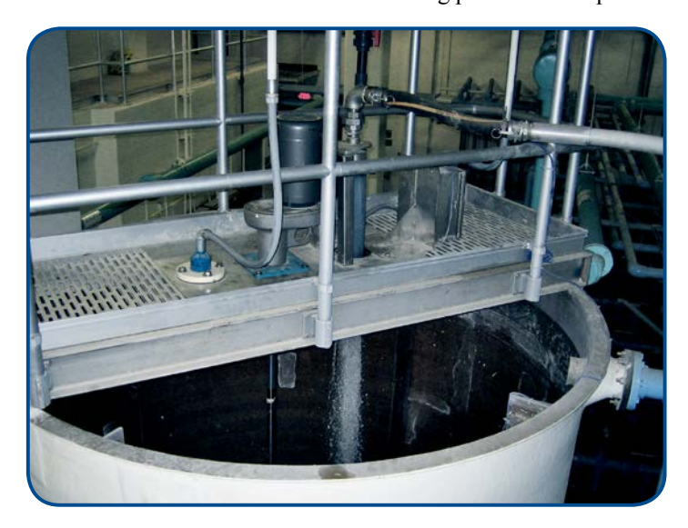
Many operational variables and characteristics must be considered before selecting a mixer. These include mixer type, fluid viscosity, rate of agitation, tank shape and volume, and pumping rate.