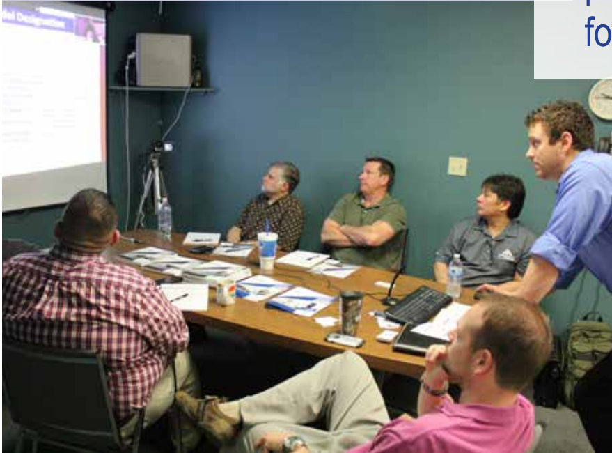
One of our training sessions

Process technology training provides valuable information for industrial engineering firm