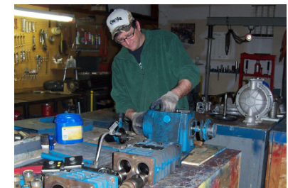
Expert repairs on every product we sell.