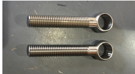
Original part – Top bolt Duplicate part – Bottom bolt

Our customer was in need of a part for an older pump and faced with long leadtimes and high costs.