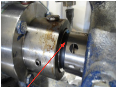
We custom designed a low operating height Type 8 mechanical seal in place of the lip seal for improved sealing.