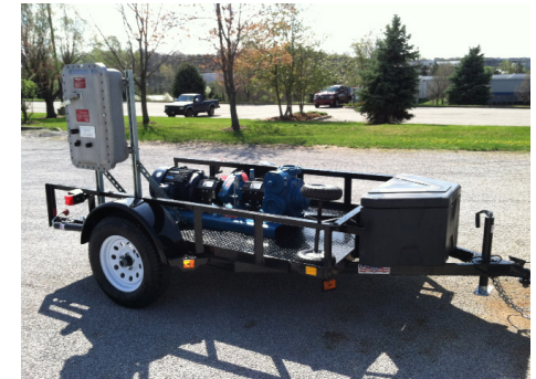
Custom Blackmer trailer package built to customer requirements.

We really enjoy these type of challenges!