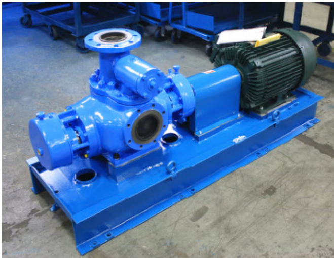
Blackmer Positive Displacement Twin Screw Pump