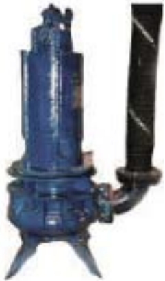
Left: Wemco model 4x11 CES, 30 HP, 120 GPM @100' TDH, pumping coal slurry.