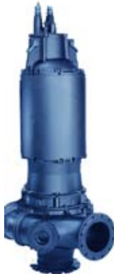
Right: Wemco immersible model E4K Hidrostal, 30 HP, 120 GPM @100 TDH, pumping coal slurry.

Customer also purchased the E4K Hidrostal with the immersible motor for the "run in air" capability on the occasion when the water level drops below the level of the motor.