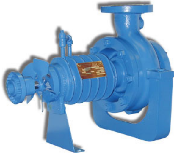
Dean RA3000 series air cooled hot oil pump.