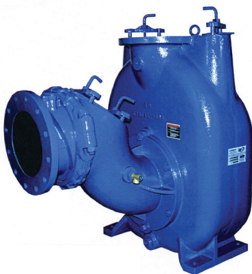
The Weir Self-Primer solids handling pump with Buzzsaw technology. (See reverse side for exploded view and features.)

When R.A. Ross & Associates introduced a local chicken plant to the WEIR WEMCO® Self-Primer pump they were very excited by what they saw. The tool-less, shim-less impeller adjustment, the Buzz Saw wear plate, and superior materials of construction were among the main features they liked... and wanted! However, with relatively new self-primer pumps from a different manufacturer in use, the chicken plant could not justify the cost of replacing each unit. With its "one step ahead" style of thinking WEIR had that problem solved. When designing the WEMCO® Self-Primer, other industry standard pumps were taken into consideration. The rotating assembly in the WEMCO® Self-Primer pump was a direct replacement for the pump casing currently in use, making it possible to upgrade each unit to have the benefits of the WEMCO® Self-Primer at a lower cost than replacing the entire pump.