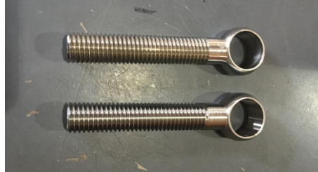
Original part – Top bolt Duplicate part – Bottom bolt

Our customer was in need of a part for an older pump and faced with long leadtimes and high costs.