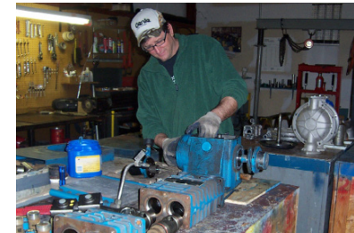
Expert repairs on every product we sell.