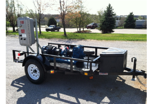
Custom Blackmer trailer package built to customer requirements.

We really enjoy these type of challenges!